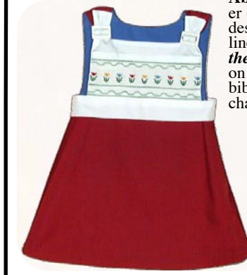
Left: Same jumper as above, reversed to red side, Tulips smocked on white bib.