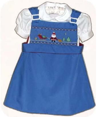
Above: Blue jumper (lengthened as described on left), lined in red, Twas the Night smocked on matching blue bib, worn over purchased blouse.

Connect these marks to create a new cutting line for hem.