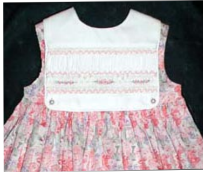
Bib trimmed with Children's Corner Petite Piping , smocking design is the easy pearl & silk ribbon variation of Creative Keepsakes' # 702, Hannah Marie .

p.o. box 37 Russellville, AR 72801 479-967-7061 www.creativekeepsake.com