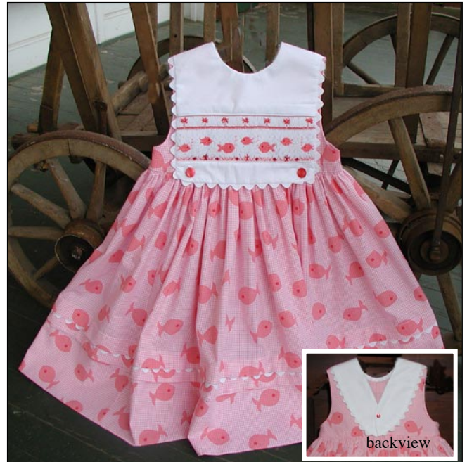
Bib trimmed with rick-rack, smocking design is Creative Keepsakes' # 707, Tiny Bubbles